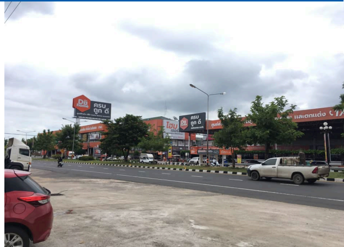
Figure 12: Dohome's flagship store in Ubon