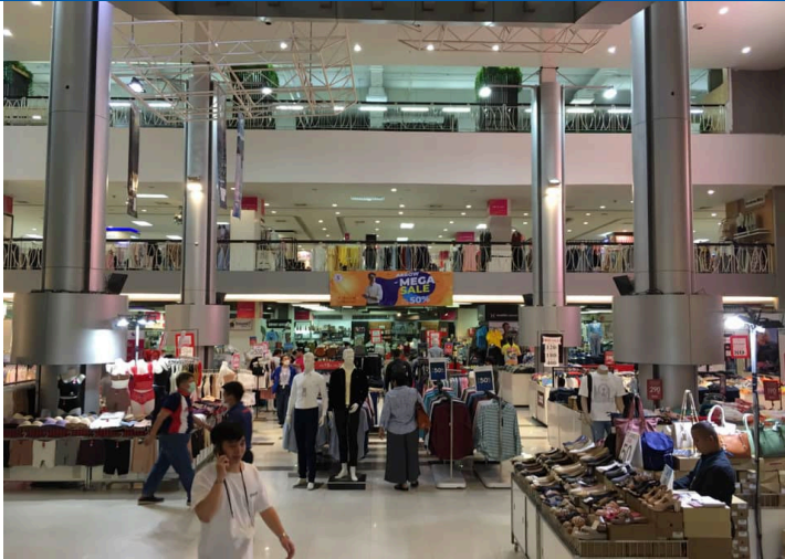
Figure 9: Sunee Tower – department store ambience