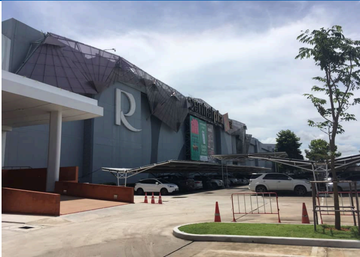
Figure 1: Central Ubon shopping mall