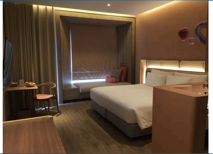
Figure 8: Centara Ubon Hotel guest room