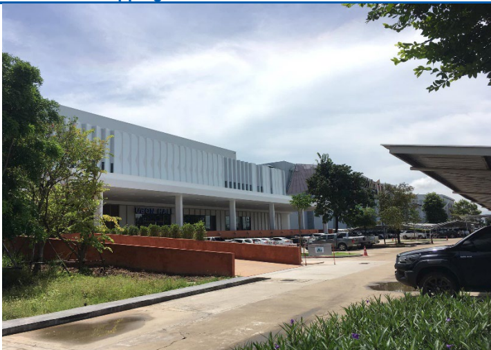
Figure 5: CPN's recently opened Ubon Hall is located next door to its shopping mall and hotel