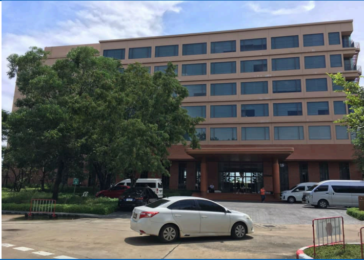
Figure 7: CPN owns the Centara Ubon Hotel