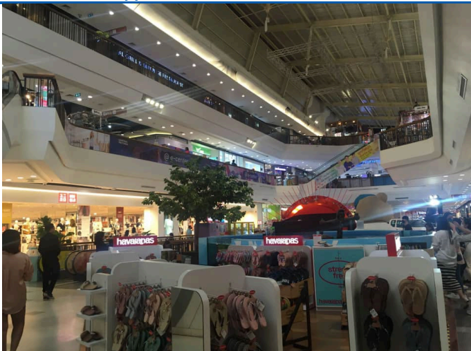
Figure 3: Central Ubon – uplifting tenant mix with international brands have supported customer traffic and tenant sales