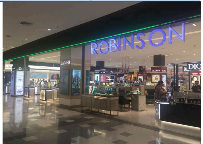
Figure 4: Robinson Department Store at Central Ubon offers a broad selection of leading international cosmetic brands