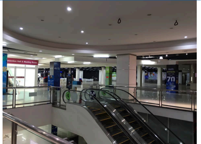
Figure 10: Sunee Tower – leasable retail mall