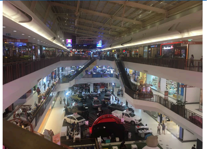
Figure 2: Central Ubon mall traffic on 21 Sep at 6.30pm